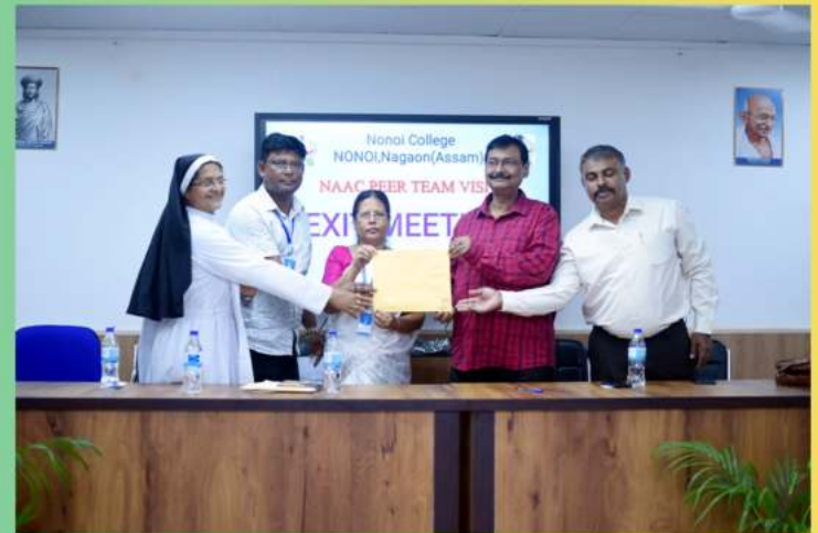
Confidential report of NAAC PEER TEAM Handovered to Principal, Nonoi College