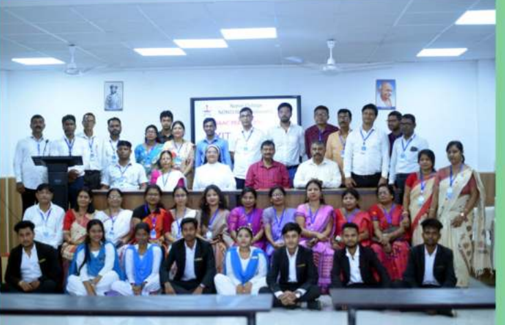
Teachers, Office Staff and Student Union with NAAC PEER TEAM